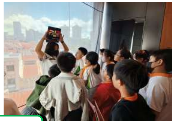
Frontiers having hands-on learning experiences and listening to their guides