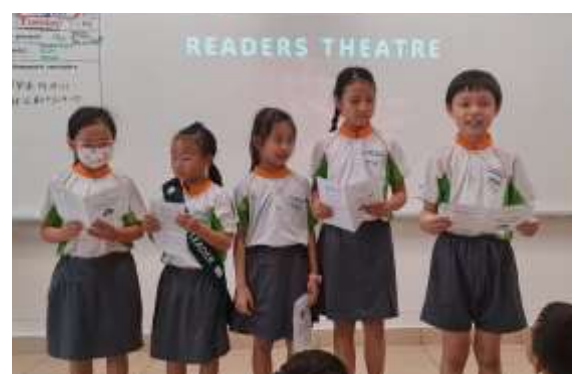
P1 Frontierers reciting poems and P2 and P3 Frontierers presenting in a Readers Theatre