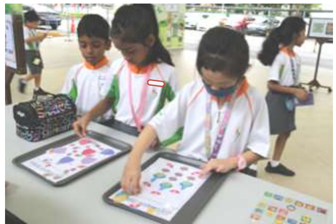
Frontierers trying their hands at this year's Racial Harmony Day activities.