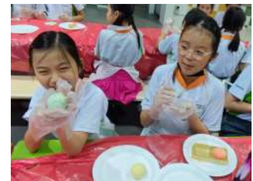
Frontierers participating in a quiz and mooncake-caking