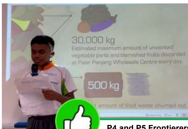
P4 and P5 Frontierers taking on the role of Junior Reporters