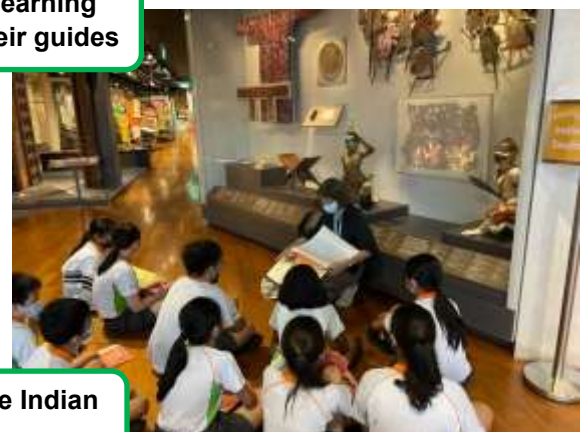
Frontiers learning about the contributions of the Indian community in Singapore