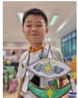
Frontierers with the Rangoli and Wau Bulan