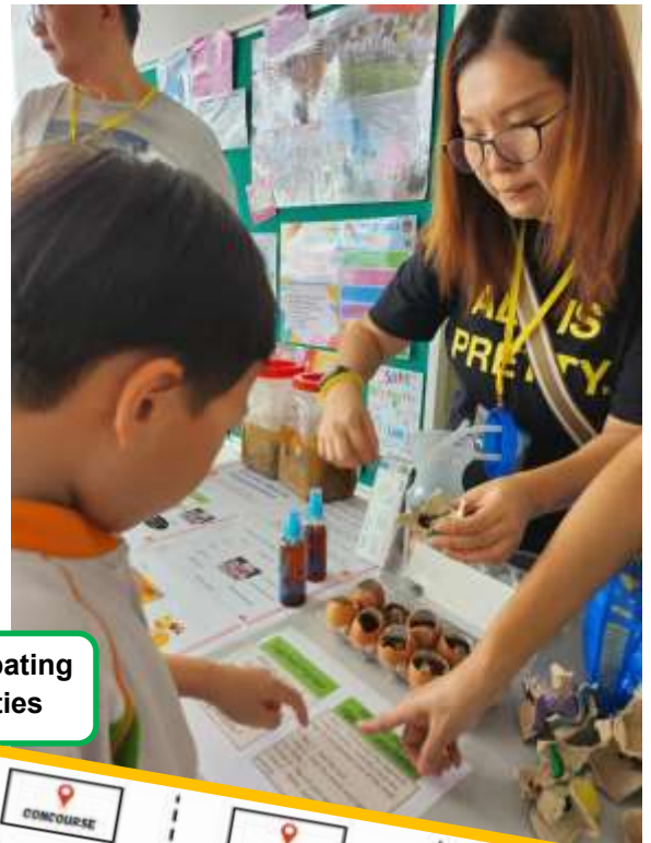
Frontierers participating in Science activities